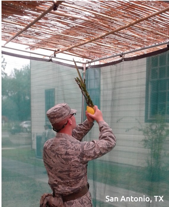
San Antonio, TX