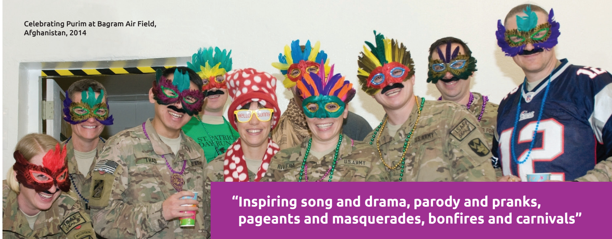
Celebrating Purim at Bagram Air Field, Afghanistan, 2014

“Inspiring song and drama, parody and pranks, pageants and masquerades, bonfires and carnivals”