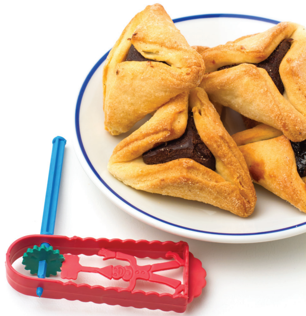
Grogger and a plate of hamantaschen

Customs embraced by celebrants over the years include masquerading, performing Purimshpiel parodies, sending food parcels to one another and the poor ( Mishloach Manot ), and preparing three-cornered pastries filled with prunes, fruit or a poppy seed mix, called Hamantaschen .