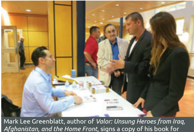
Afghanistan, and the Home Front, signs a copy of his book for a PWH participant after leading a talk at the JCC Author and Speaker Series

The pilot year also had moments of learning for JWB. The definition of veteran and the mission of this program changed as the year progressed, helping JCCs serve a broader population of service members and veterans. Project Welcome Home is not one size fits all – it needs to be adapted to meet the needs of the JCC and the service members and veterans it is serving. Project Welcome Home is also being presented as a program to raise awareness about Jews serving in the U.S. military. This Guide to Best Practices is the first step in bringing the lessons from the pilot year to all JCCs and helping them find a way to acknowledge and honor Jewish men and women who serve our country.